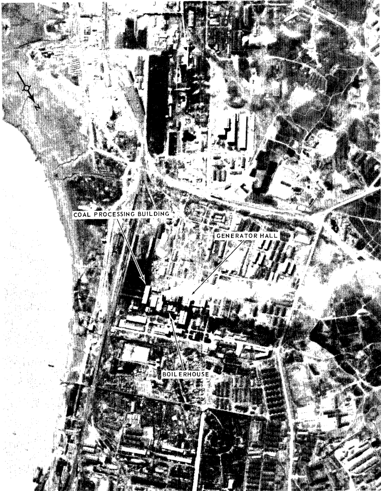
FIGURE 5. NAN-CHING HEAT AND THERMAL POWER PLANT TA-CHANG-CHEN,