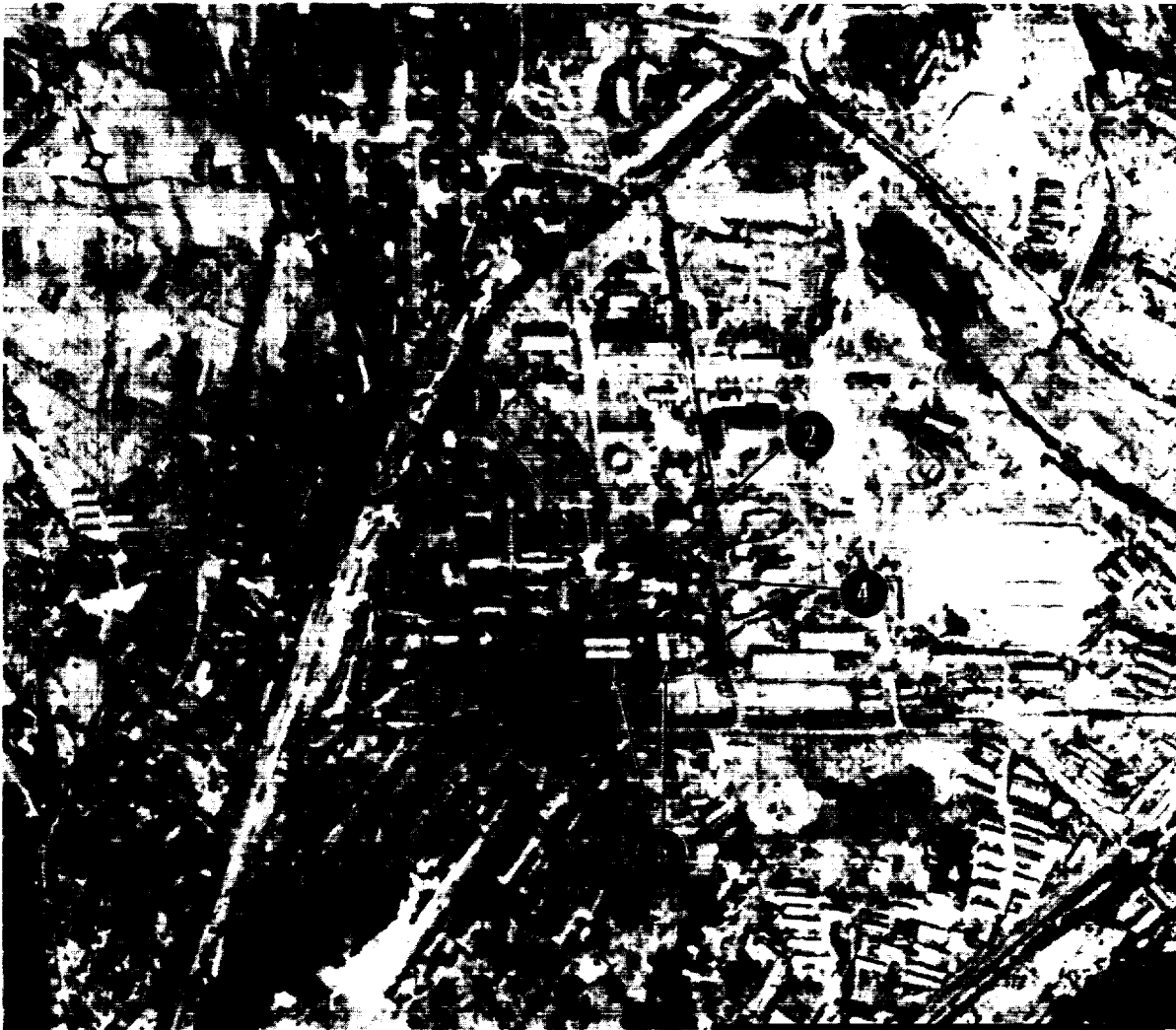
FIGURE 3. SAN-MING HEAT AND THERMAL POWER PLANT, [REDACTED]