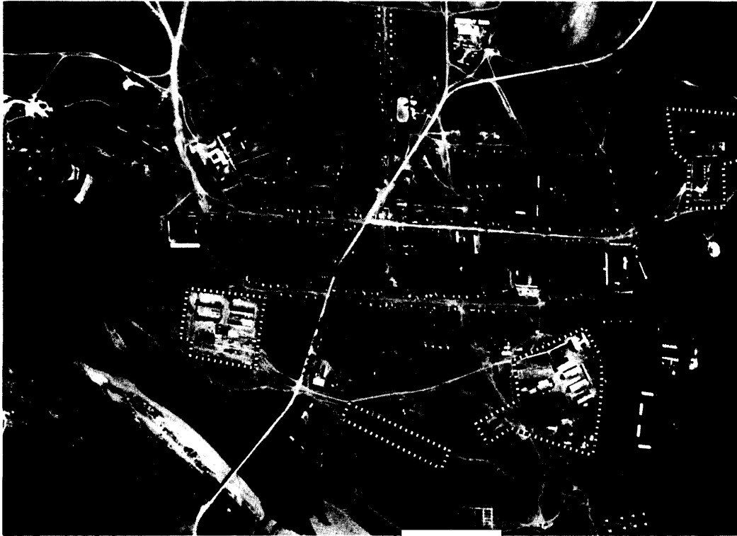
NOVOGEORGIYEVKA ARMY BARRACKS AL-1