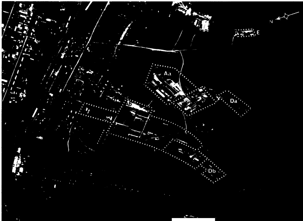
POGRANICHNYY ARMY BARRACKS SOUTH AL-2 [redacted] (44-24N 131-22E)