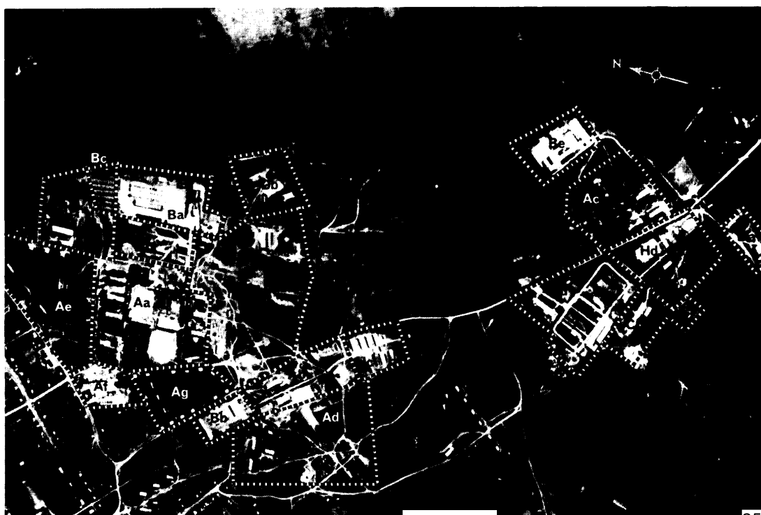
SERGEYEVKA ARMY BARRACKS AL-I.