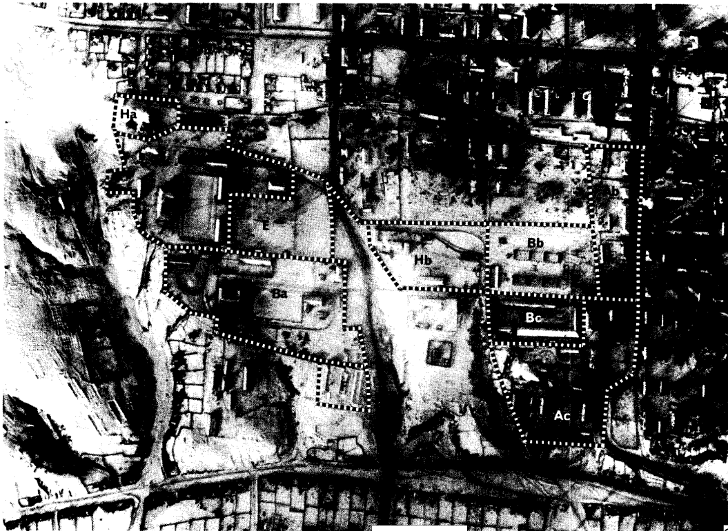
SVOBODNY Y ARMY BARRACKS AL-2, (51-21N 128-08E)