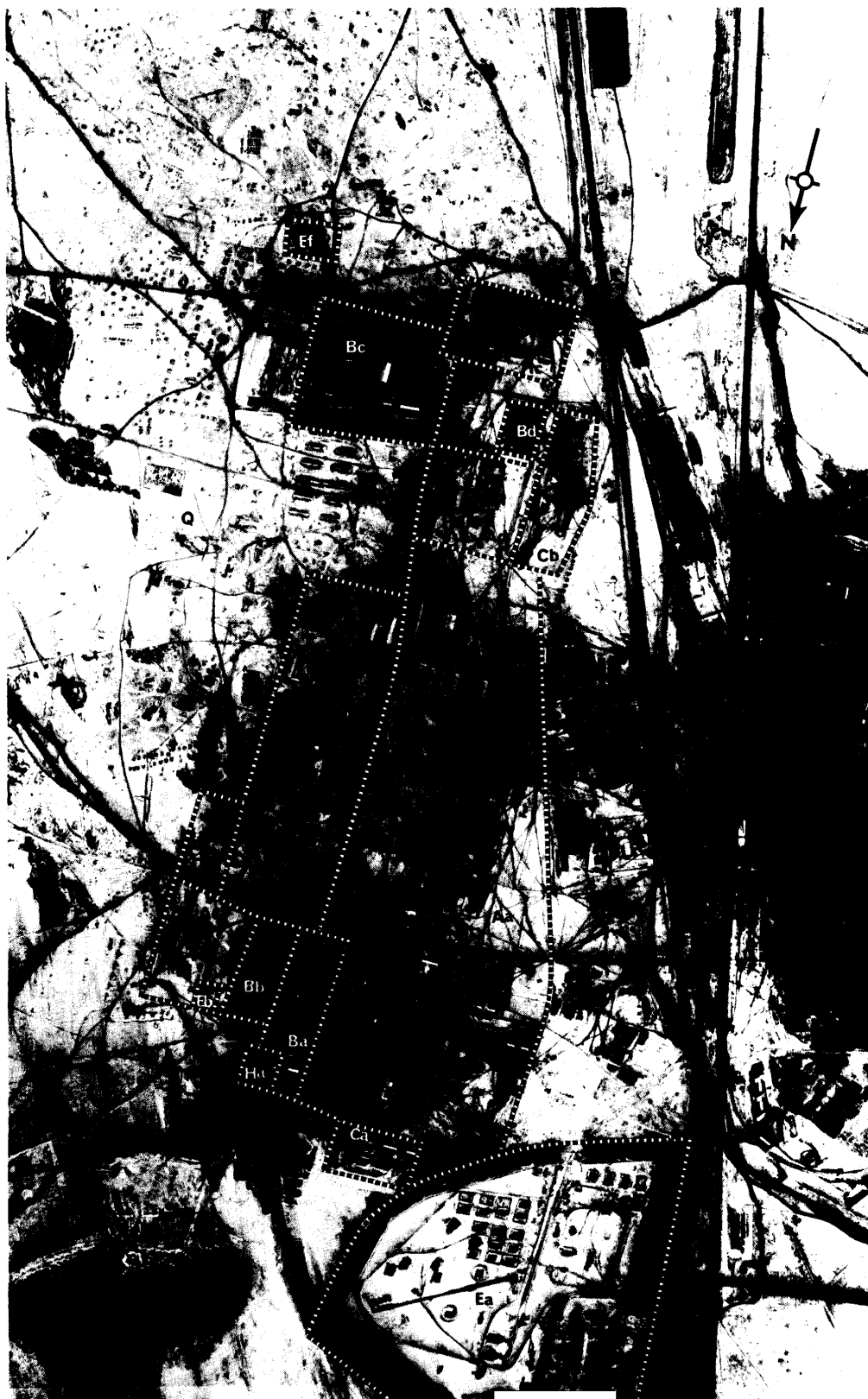
SHIRLOVAYA GORA ARMY BARRACKS AL-1, (50-31N 116-23E)