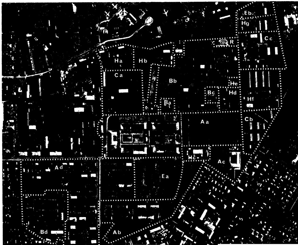
IRKUTSK ARMY BARRACKS SOUTHEAST AL-1, (52-16N 104-20E)

Secured area contains one probable drive-in building encircled by an elliptical roadway.