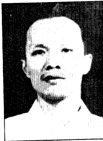
Nguyen Huu Tho Chairman