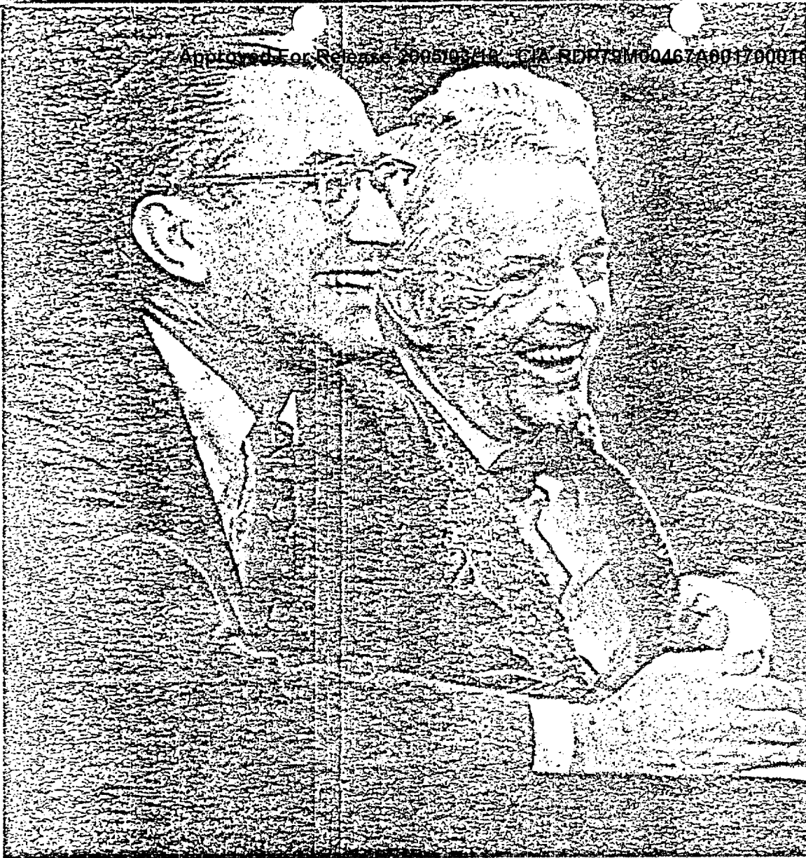
William Colby and Otis Pike

committees traditionally have, a reflection less of our diligence than of the other committees' timidity. During the next eight days we held our first seven hearings.