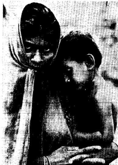
Refugee mother and child

Politically, West Bengal has been a virtual battleground since 1967, when two decades of Congress Party domination gave way to a series of short-lived multiparty coalition governments in which the Communists played a dominant role. Although Prime Minister Gandhi's Ruling Congress Party made a surprising electoral comeback last March, the coalition it formed lasted only until June because of internal squabbling and pressures arising from the Pakistani crisis.