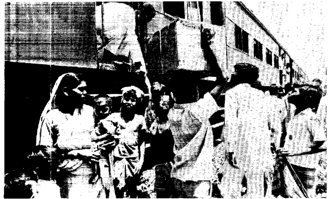
Pakistani refugees being transferred by train from West Bengal to other parts of India

supervise whatever programs it deems necessary. A $200-million program has been drawn up and, although financing has not been completed, new sources of funding have been found. A tax has been imposed on goods entering the metropolitan area, and $8.6 million has been borrowed by means of public bonds, the first time in years that any Calcutta authority has successfully entered the bond market. Special assistance, about $40 million, is expected from New Delhi. Previous