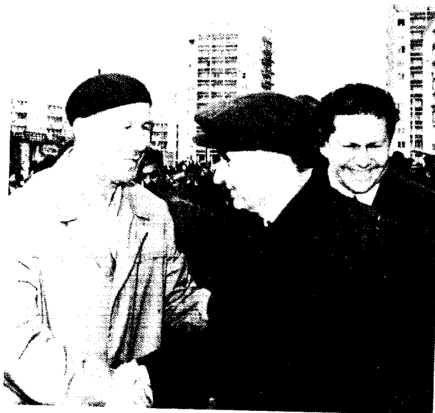
Ceausescu talks with worker in Cluj.

As one remedial action, Ceausescu recommended that working people directly active in production should participate in the trade union's directing bodies, so that the latter are not based entirely on salaried trade union bureaucrats. On 27 March the trade union central council duly elected seven deputy chairmen to its bureau, five of whom will remain active in production work.