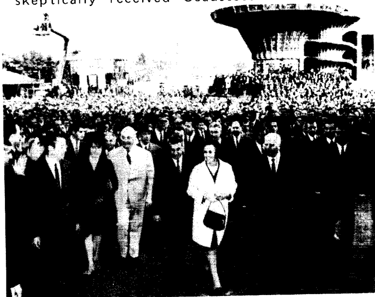
Inhabitants of Bucharest city cheer the party General Secretary and his wife (center) at a local celebration.

The workers and peasants have probably skeptically received Ceausescu's frenetic