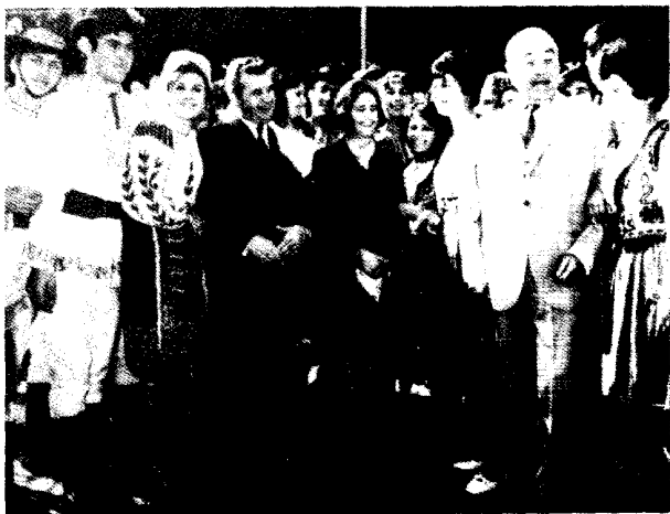
General Secretary Ceausescu, his wife Elena (center), and Premier Ion Gheorghe Maurer (right) on a typical outing, among young people at a harvest festival.

speechmaking in the last few months. Although he has given assurances that the party is in constant touch and consultation with them, he has in essence promised very little. The new five-year plan reportedly calls for a 20 percent increase in wages—about 4 percent yearly—but makes no commitment that consumer prices will not also be raised, just as they have been in the past. For the wage earner, the continued stress on industrialization means scant hope for a better standard of living.