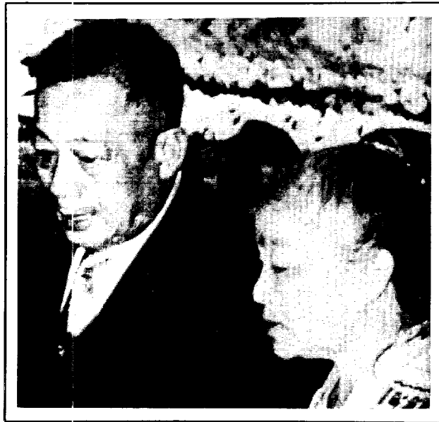
King Savang Vatthana and Queen Khamphoui...they reign but do not rule.

The King plays his ceremonial role with some skill. Although well informed on domestic and foreign affairs, he has shown some reluctance to be drawn into the day-to-day problems of national administration. This detachment is