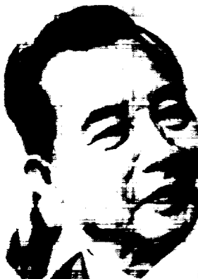
The prime minister, Prince Souvanna Phouma...the indispensable man, at least in the eyes of the great powers.

For more than a century and a half, until the 1940s, the senior member of this branch of the royal family served as the "second King," or viceroy of Luang Prabang—and in this position carried on the actual government of the country.