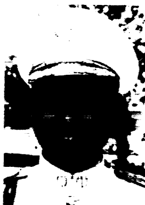
General Vang Pao...for once, the medals are earned...a tribal chieftain of the Meo minority and the most aggressive military leader in Laos.

Influential and powerful though General Vang Pao has become in his own area, there is a