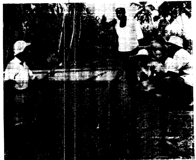
Chinese Agricultural Specialist in Tanzania