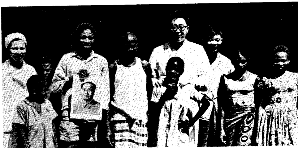
Chinese Doctor And Medical Personnel In Tanzania

Peking appears to view Zambia as one of its brightest prospects for future expansion. Although the Chinese had never before extended aid to the Lusaka government, in 1967 they gave it a $16.8 million interest free loan for the construction of a road from Lusaka to western Zambia. Soon after, they agreed to build the TanZam railroad which will give the Zambians an outlet for their copper through friendly Tanzania rather than Rhodesia. By supplying technicians and workers for their projects, the Chinese have been