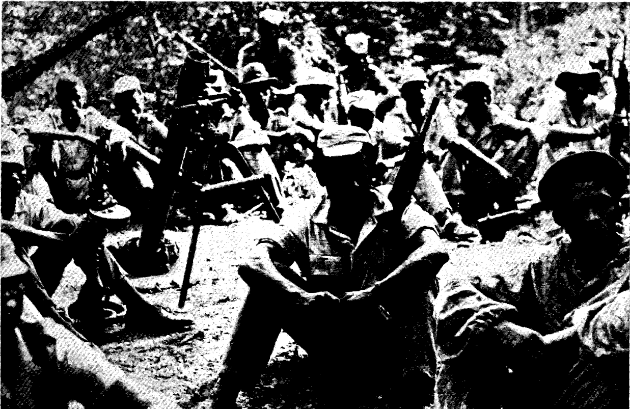
Guerrillas in Portuguese Guinea with Chinese-made Arms

Vice Premier Hsieh Fu-chih, NCNA 26 April 1969