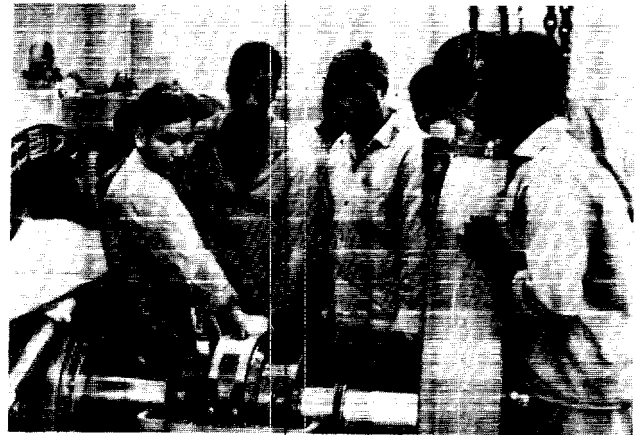
Chinese Technician in Guinea

The aid programs in Congo (Brazzaville) and Mauritania are smaller, but the Chinese nevertheless continue to demonstrate an active interest in both states. Elsewhere in Africa, however, significant Chinese presence and influence are almost