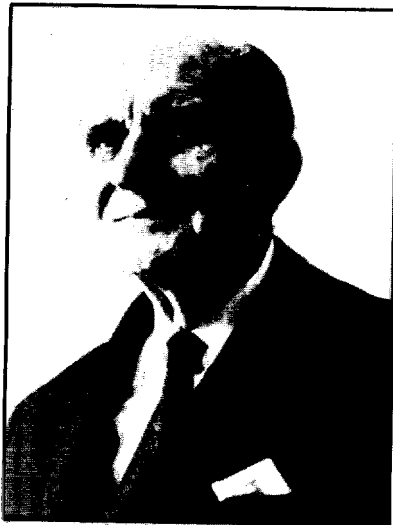
Former Prime Minister GEORGE PAPANDEOU