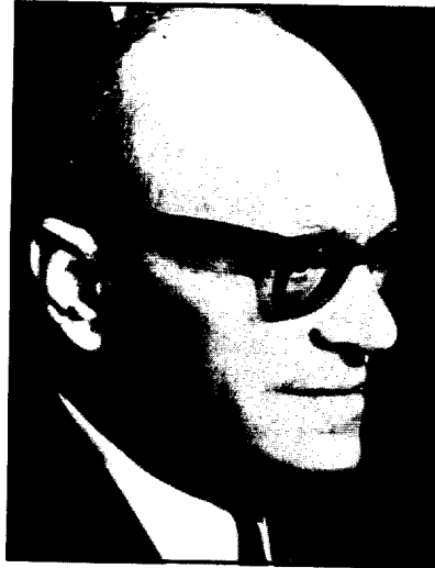
Prime Minister STEPHANOPOULOS