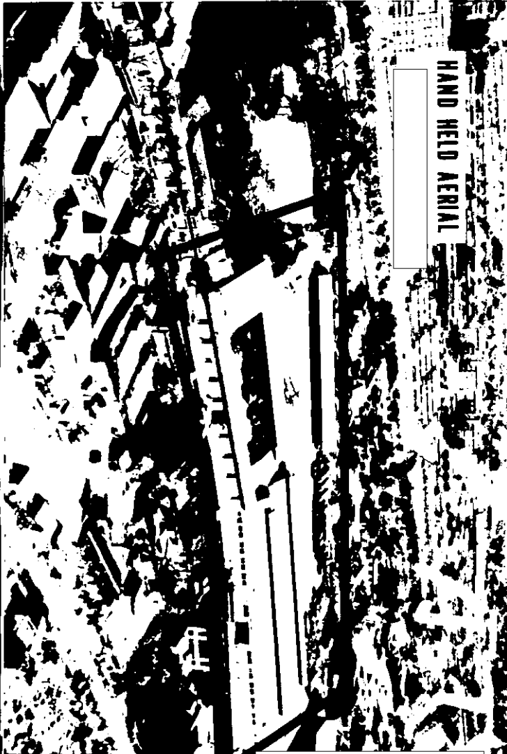
HAND HELD AERIAL