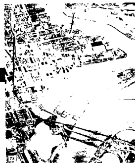
URBAN AND REGIONAL PLANNING