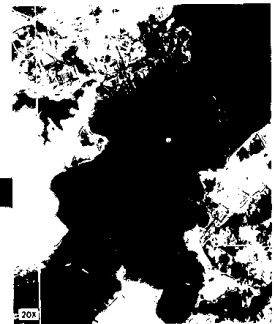
AIR AND WATER POLLUTION