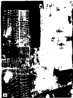
AGRICULTURAL LAND MANAGEMENT