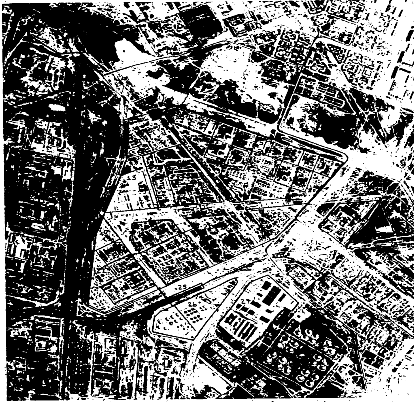
NOVO-BAKU PETROLEUM REFINERY Baku, USSR 40 24 20N - 49 55 10E