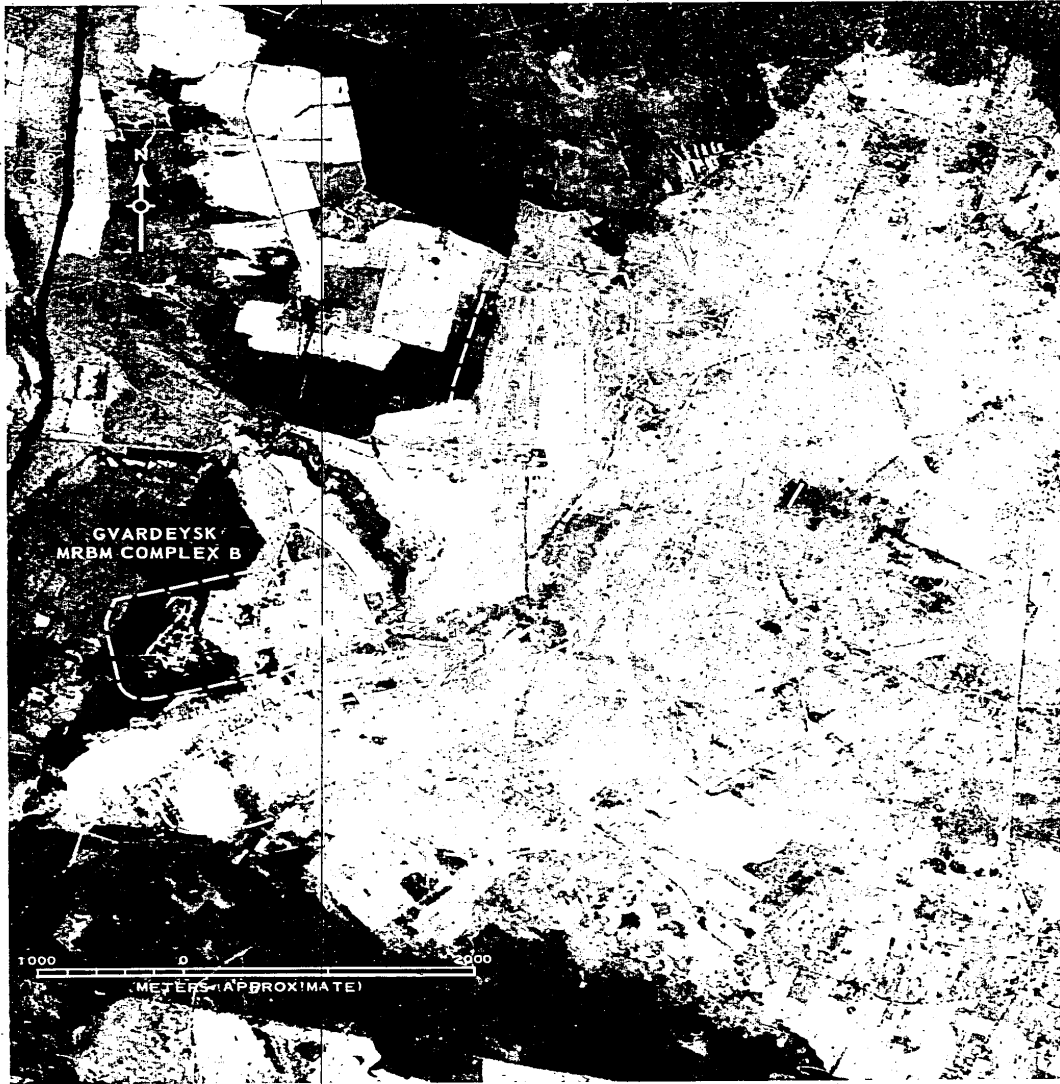
FIGURE 2. GVARDEYSK ARMY TRAINING AREA, GVARDEYSK, USSR, [REDACTED]

Handle Via TALENT-KEYHOLE Control System Only