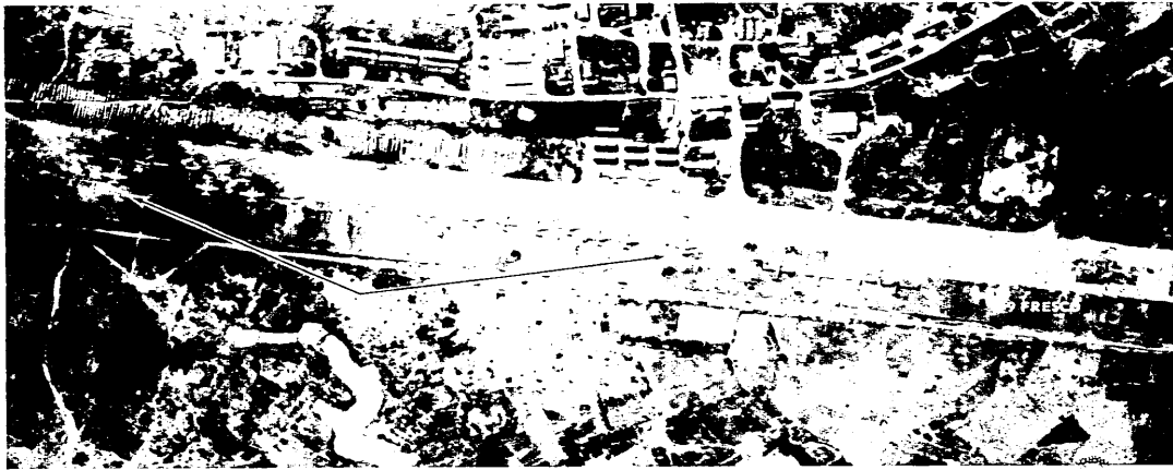
FIGURE 2. HASANUDDIN AIRFIELD, MANDAI, INDONESIA, SECRET 25X1D