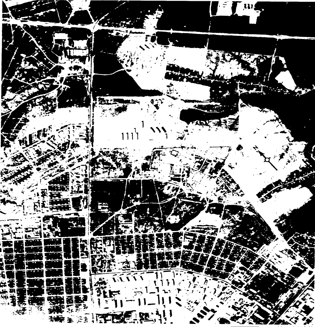
FIGURE 2. MINSK BARRACKS AND ARTILLERY OCS, MINSK, USSR.