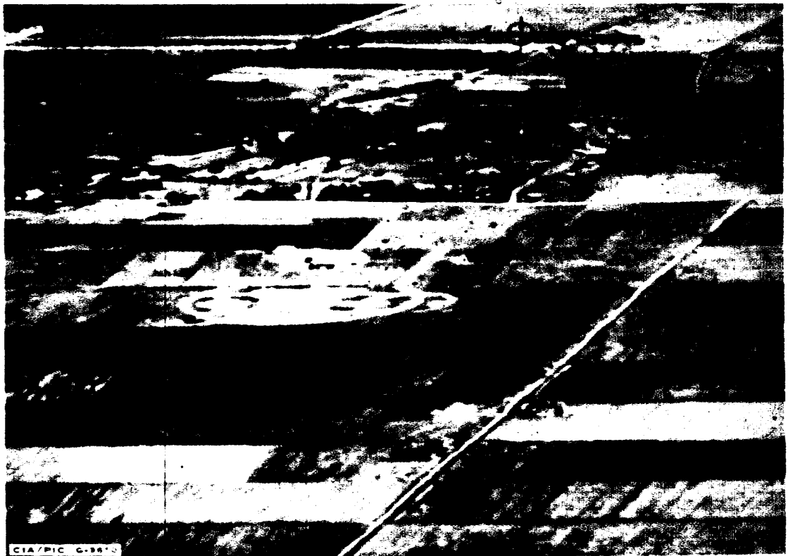
Figure 1. SAM SITE 5 NM NE OF DURRES.

NO : PIC/JB-1008/60 DATE : 13 September 1960 COORD: 41°22'08"N 19°31'42"E