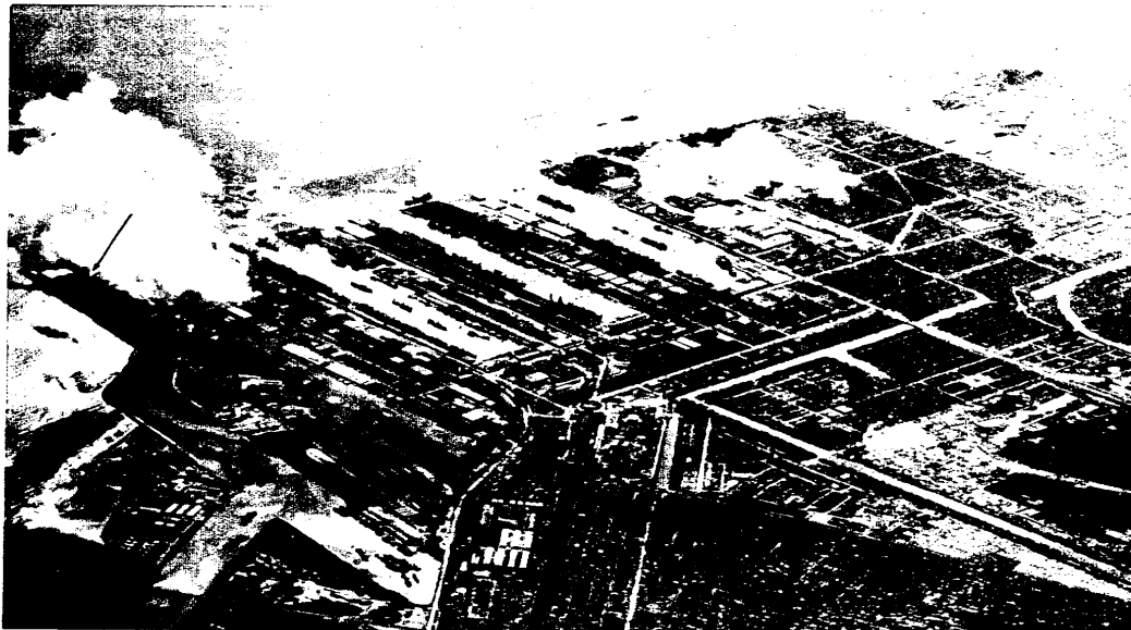
FIGURE 1. PORT FACILITIES, TANDJUNGPRIOK, INDONESIA, SECRET

age sheds, and a breakwater. Since the breakwater has been extended east approximately 5,000 ft to the corner of Fisherman's Harbor where 2 small basins have been dug into the east bank and 4 small piers and 2 small boat basins with quayed shorelines have been constructed.