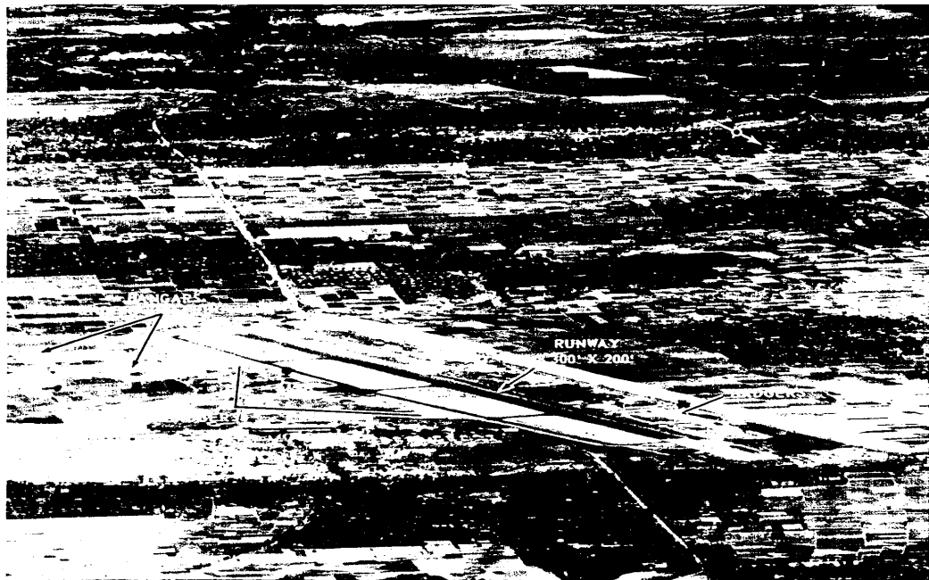
FIGURE 1. ISWAHJUDI AFB, MAOSPATI, INDONESIA. [REDACTED]

Aircraft include 21 Badger, one probable Badger in the hangar, and 6 unidentified.