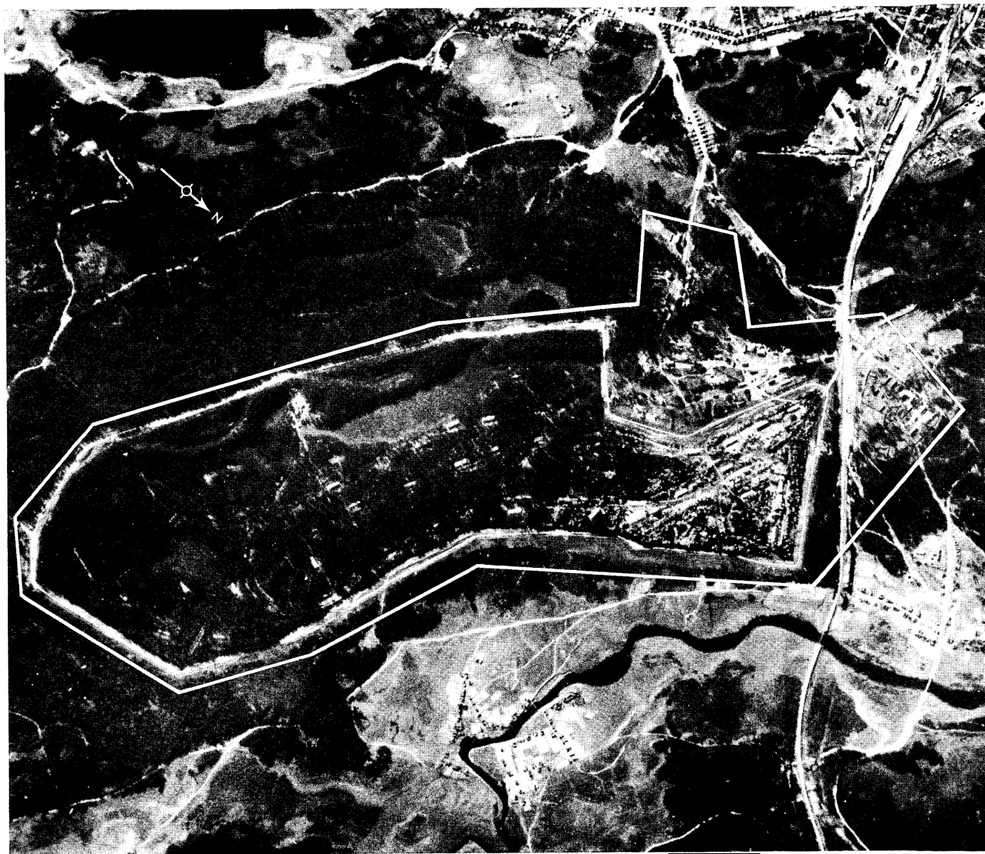
FIGURE 2. TOROPETS AMMUNITION DEPOT NORTHEAST, TOROPETS, USSR, [REDACTED]