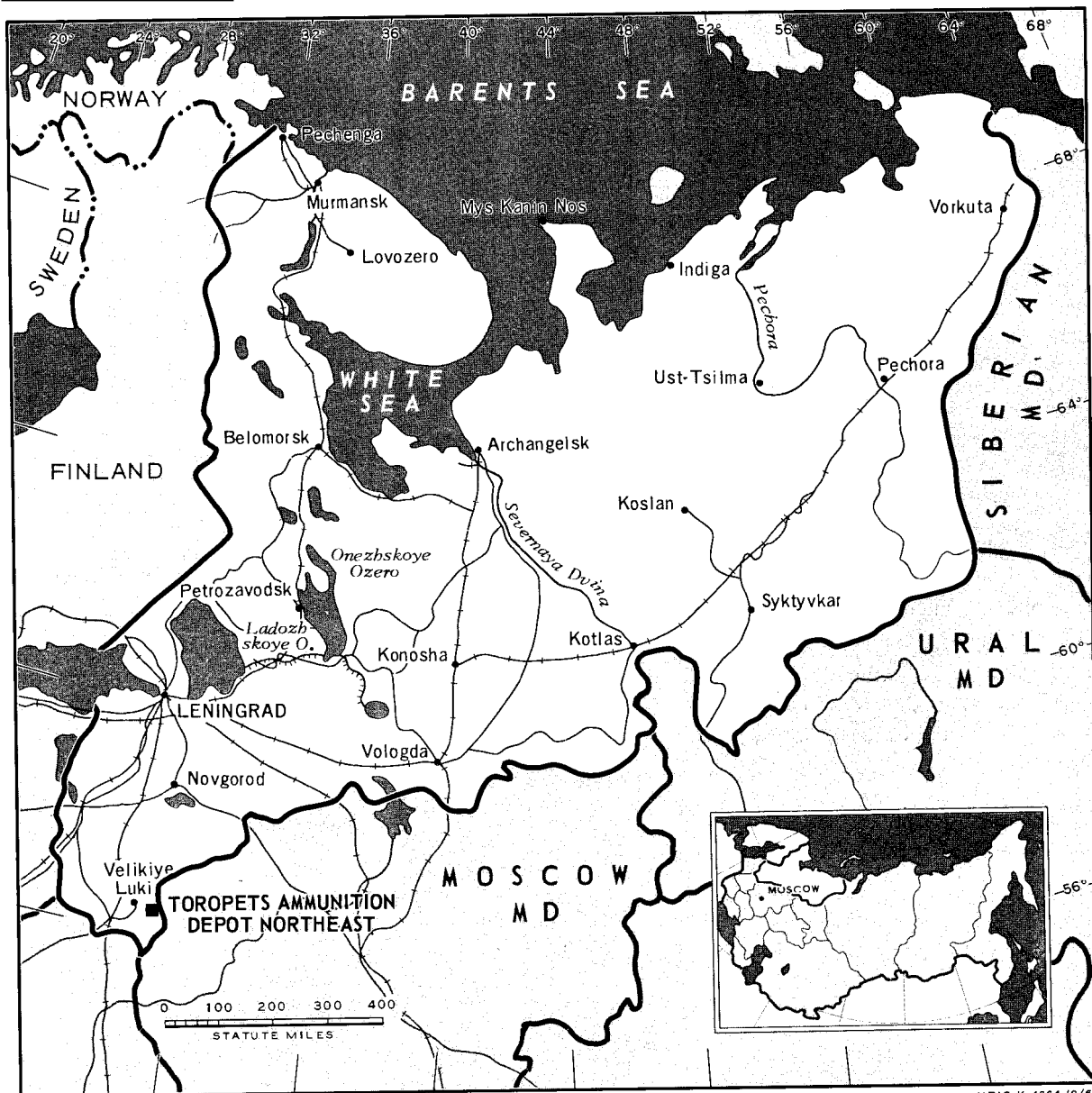
FIGURE 1. LOCATION OF TOROPETS AMMUNITION DEPOT NORTHEAST.