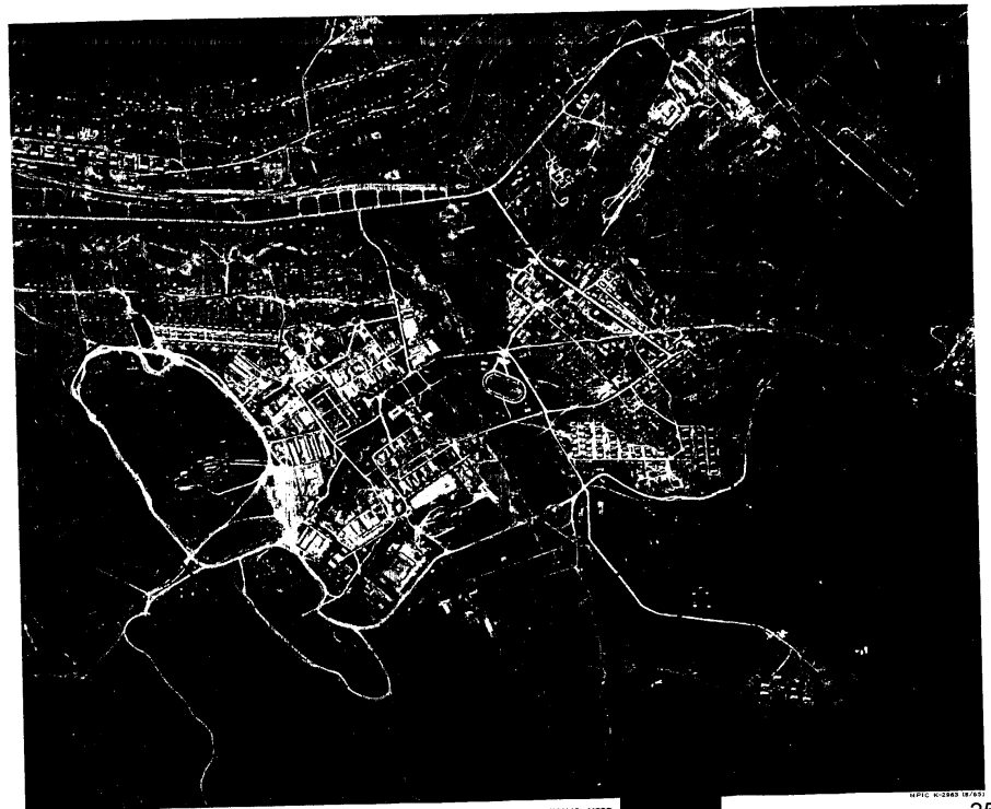
FIGURE 2. MILITARY INSTALLATION, SMOLYANINOVO, USSR.