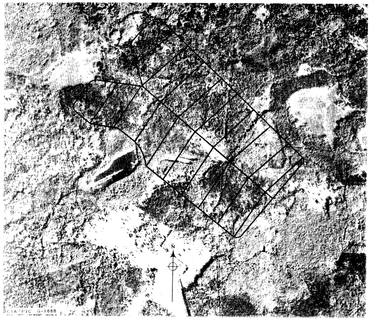
FIGURE 1. HERRINGBONE SAM SITE C-32. Small format aerial photography of [redacted] was used to determine the actual location of this site which has been overprinted in red on German World War II photography

SUBJECT : Herringbone Surface-to-Air Missile Site C-32 : Missile Site C-32 LOCATION: 27 nm NW of Moscow, USSR NO : PIC/JB-1012/60 DATE : 31 October 1960 COORD : 56-02-30N 37-00-30E