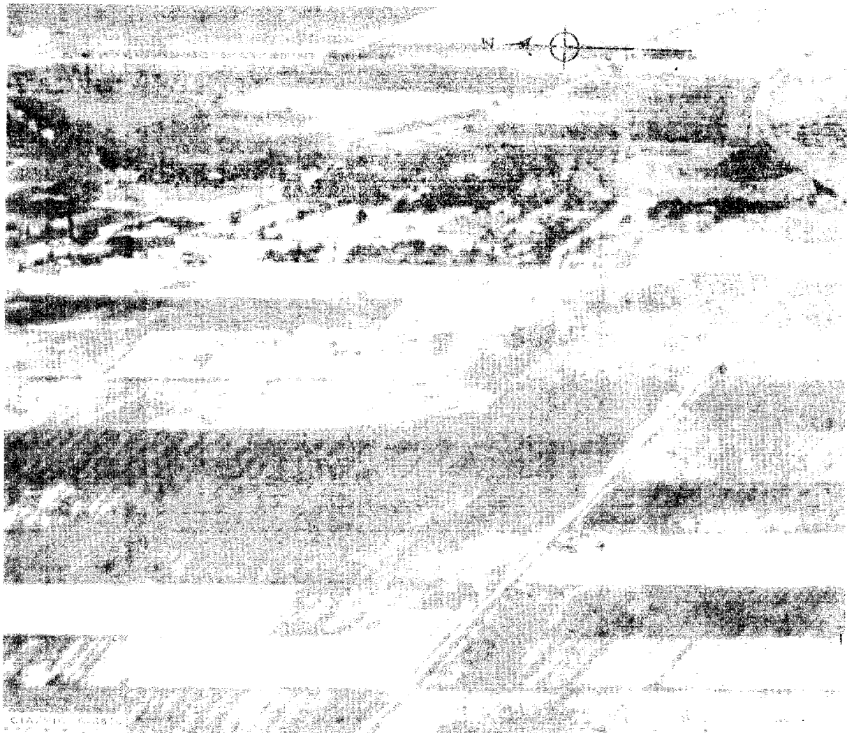
Figure 1. SAM SITE 5 NM NE OF DURRES.

NO : PIC/JB-1008/60 DATE : 13 September 1960 COORD: 41°22'08"N 19°31'42"E