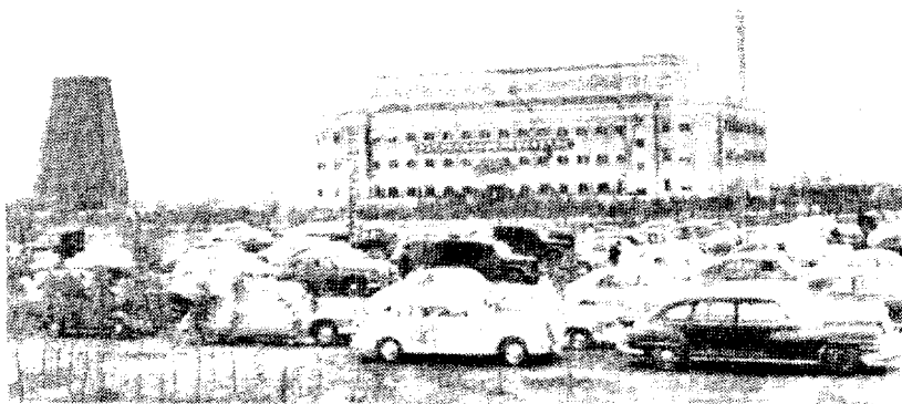
FIGURE 2. VIEW OF PEIPING REACTOR WITH PROMINENT COOLING TOWER AT THE LEFT.