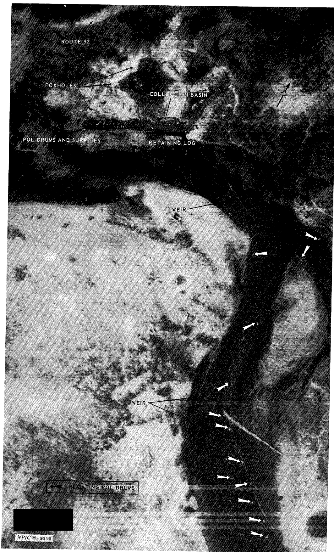
25X1D FIGURE 3. TRANSSHIPMENT POINT, SE BANG HIENG RIVER