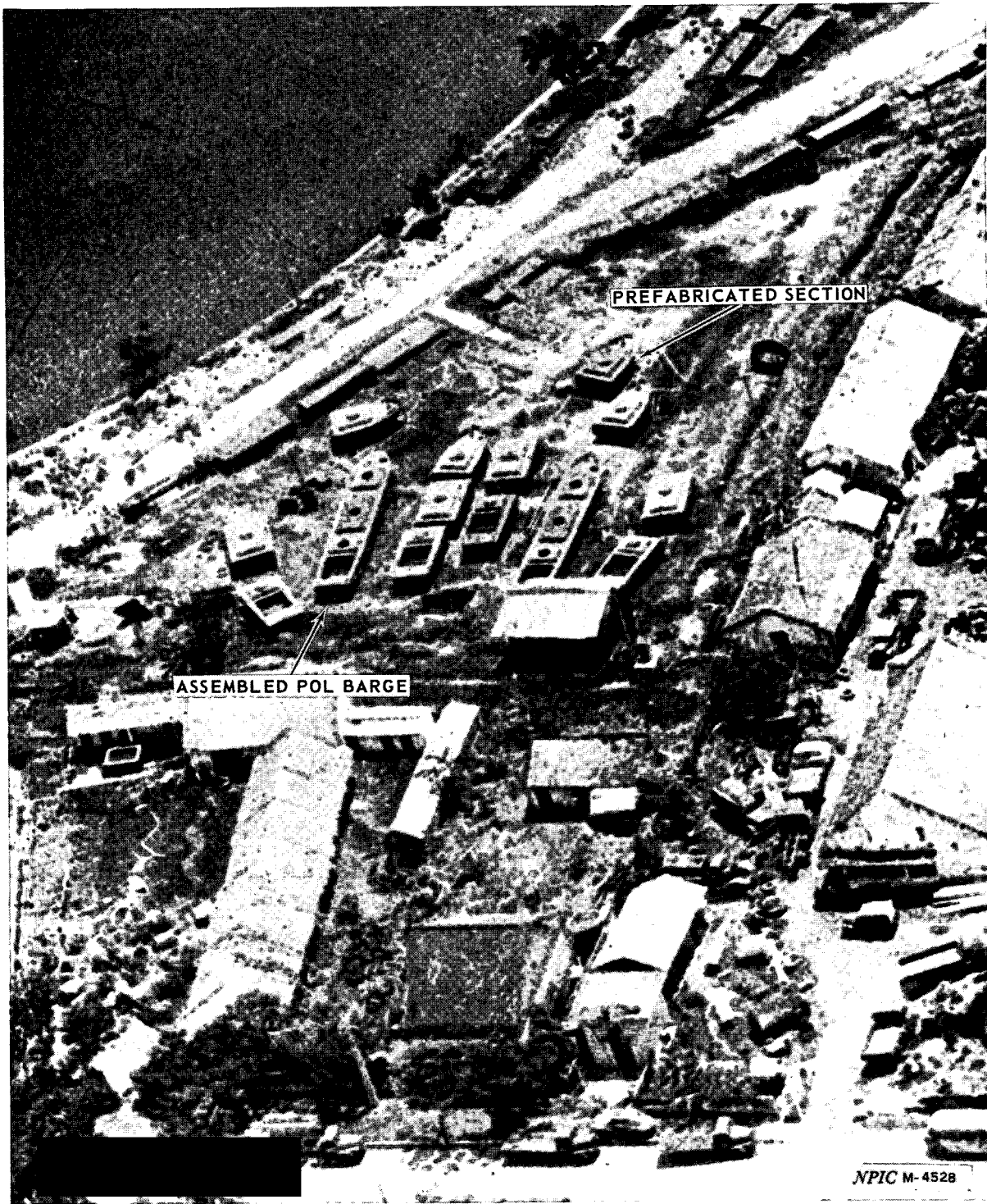
FIGURE 2. ASSEMBLY OF PREFABRICATED BARGE SECTIONS, HAIPHONG, NORTH VIETNAM.