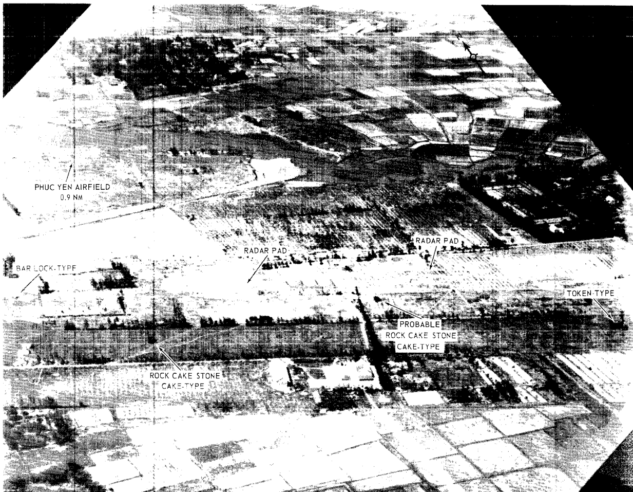
PHUC YEN EW/GCI RADAR SITE, NORTH VIETNAM.