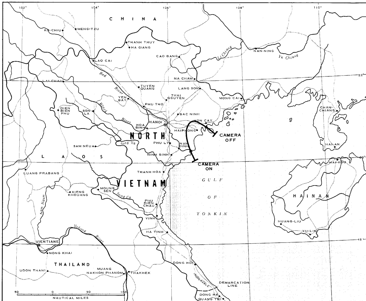
APPROXIMATE TRACK OF MISSION 5505, 10 APRIL 1966