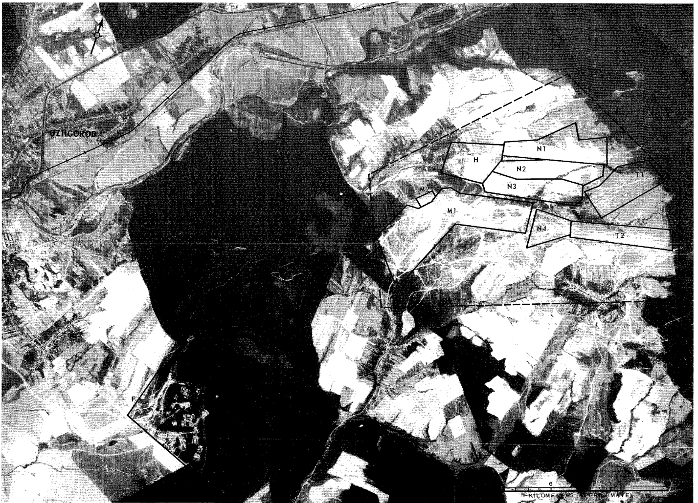
FIGURE 2. MILITARY TRAINING AREA, UZHGOROD, USSR, [REDACTED]