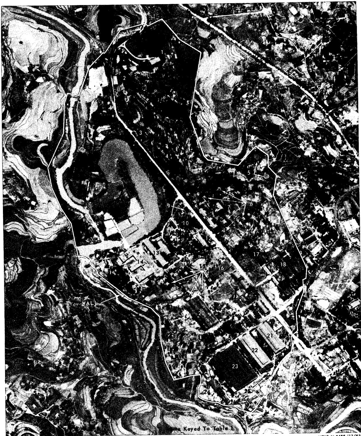
FIGURE 2. CHUNG-SHU-TO ORDNANCE PLANT NO 1, [REDACTED] 25X1D