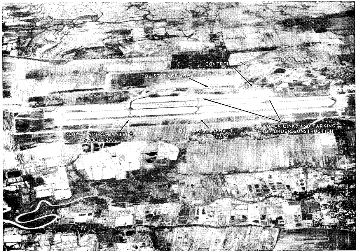
NPIC H-6360 (12/63)