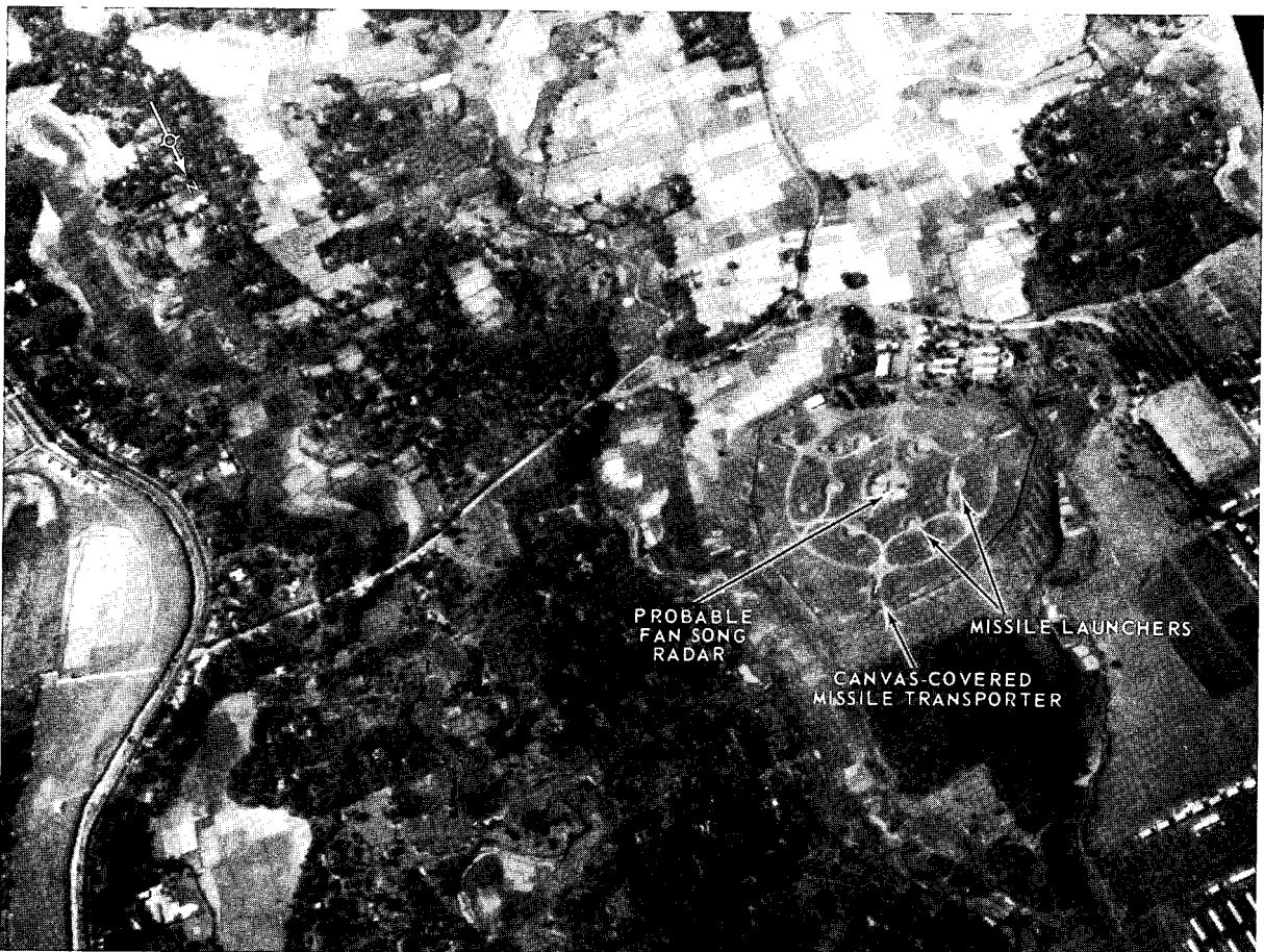
FIGURE 1. DJAKARTA SAM SITE B17-2, [REDACTED]

25X1D Djakarta SAM Site B17-2 is located 15 nm south of Djakarta and 0.5 nm west of the Djakarta-Bogor highway, at UTM coordinates [REDACTED] 25X1D The SA-2 site is complete and secured, and consists of 6 canvas-covered revetted launchers; an occupied guidance revetment with a probable FAN SONG radar and 4 short and 2 long van trailers; 3 missile-hold revetments, one with a canvas-covered missile transporter; and 3 bunkers which are adjacent to the missile-hold revetments. Support facilities consist of 5 barracks, 3 administration buildings, 3 probable vehicle-storage buildings, and 4 small storage buildings.