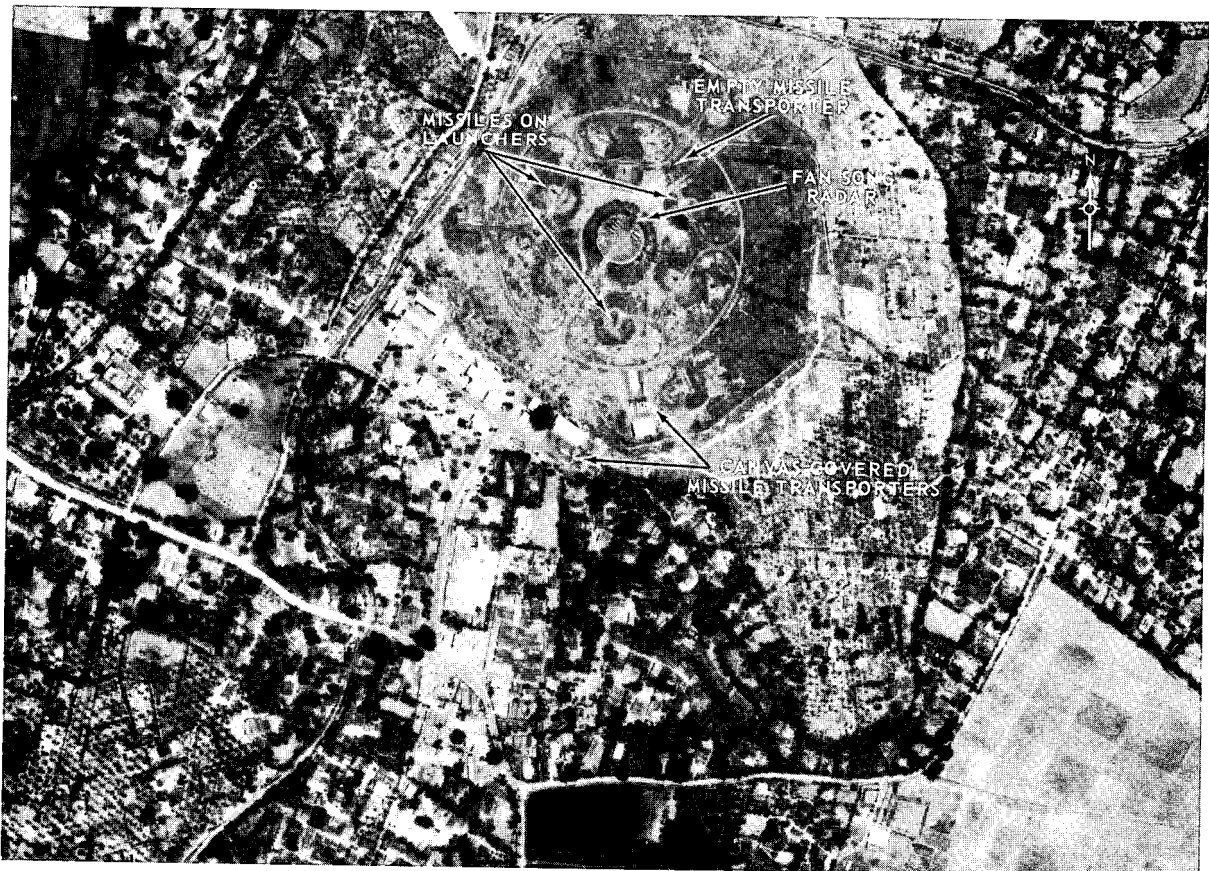
FIGURE 1. DJAKARTA SAM SITE B29-2, [REDACTED]

connect the trailers, radar, and launchers); 3 empty missile-hold revetments, each with an associated bunker; 8 canvas-covered missile transporters; and one uncovered, empty missile transporter. Support facilities consist of 5 barracks, 3 administration buildings, 2 probable vehicle-storage buildings, and 2 small storage buildings. One probable POL truck and 2 probable utility trailers are also observed.