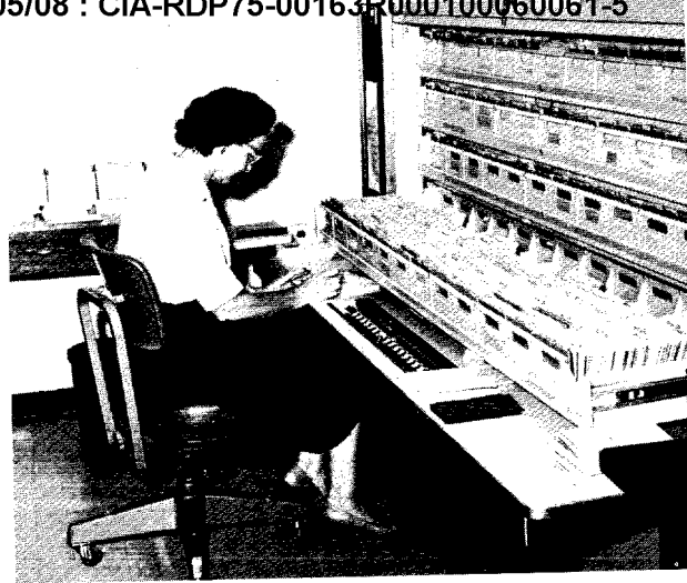
MICROFICHE POWER FILE: The nearly 1.5 million reports shown above (left) stored in some 30,000 square feet at the U. S. Department of Commerce Clearinghouse for Federal Scientific and Technical Information can be contained in six semi-automatic power files such as the one (with operator) shown (right) which contains about 400,000 microfiche records. This power file holds copies of some 250,000 reports available for semi-automatic retrieval.

Many libraries use a microform system called "micro-opaques" for card catalogs. A sheet of opaque material, it comes in various sizes ranging from three-by-five to six-by-nine inches and contains about 80-to-100 images. The concept was evolved about thirty years ago.