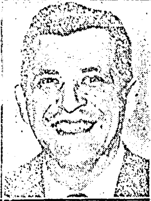
Francis Gary Powers (above) made the U-2 famous when his went down in Russia. Capability of high altitude reconnaissance is illustrated by Washington, D. C., scenes at right. Tiny rectangle at end of arrow was magnified and resulting print clearly shows Capitol and cars parked around it.