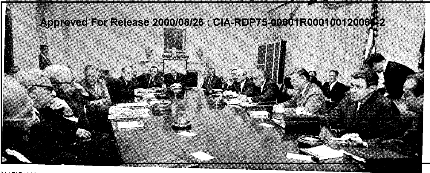
NATIONAL SECURITY COUNCIL. The CIA, says Admiral Raborn, "functions under the control of the President and the NSC."