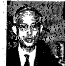
PHAN HUY QUAT Former Premier Republic of Vietnam