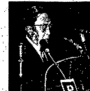
CORNELIO T. VILLAREAL Speaker of the Philippine House of Representatives