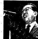
THANAT KHOMAN, Foreign Minister of Thailand