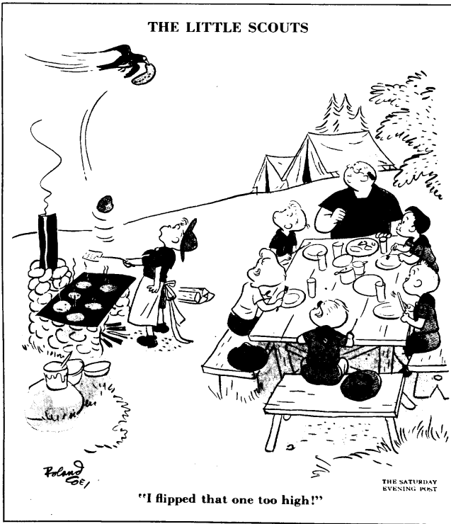
"I flipped that one too high!"