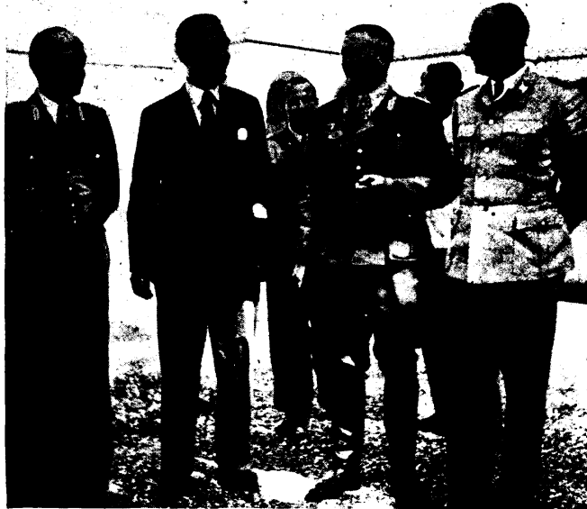
Some of the leading actors in the international melodrama. The booted Nazi is Vietinghoff, the one at the extreme right is Wolf.