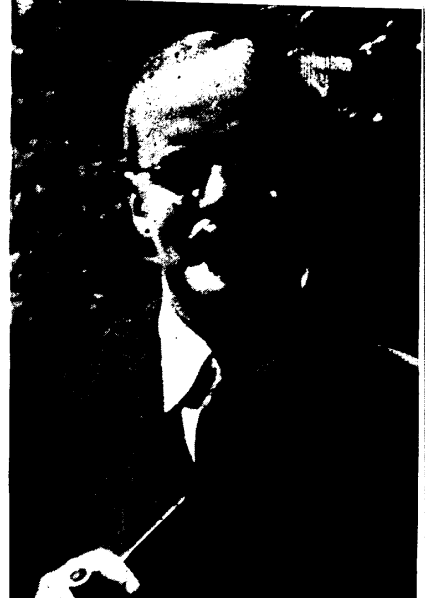
Mystery-man at our end was A. W. Dulles, of the Office of Strategic Services.

throughout its career has indignantly denied that its far-flung activities go forward in a cloak-and-dagger atmosphere. In the case of the Italian surrender, General Donovan's men have preferred to say that it was, while skillfully handled, the work of earnest amateurs. Actually, however, the proceedings at times had all the trimmings of an E. Phillips Oppenheim novel, at other moments providing tongue-in-cheek melodramatics reminiscent of Alfred Hitchcock's movie thrillers. Little Wally, the Czech operator of clandestine radio stations inside the enemy lines, provided most of the Hitchcock moments.