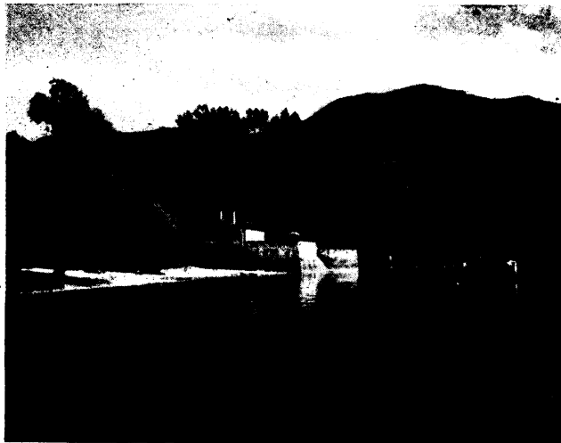
Striving hard to avoid attention, the conspirators came separately to this summer resort lake in Ascona and stayed behind locked doors.