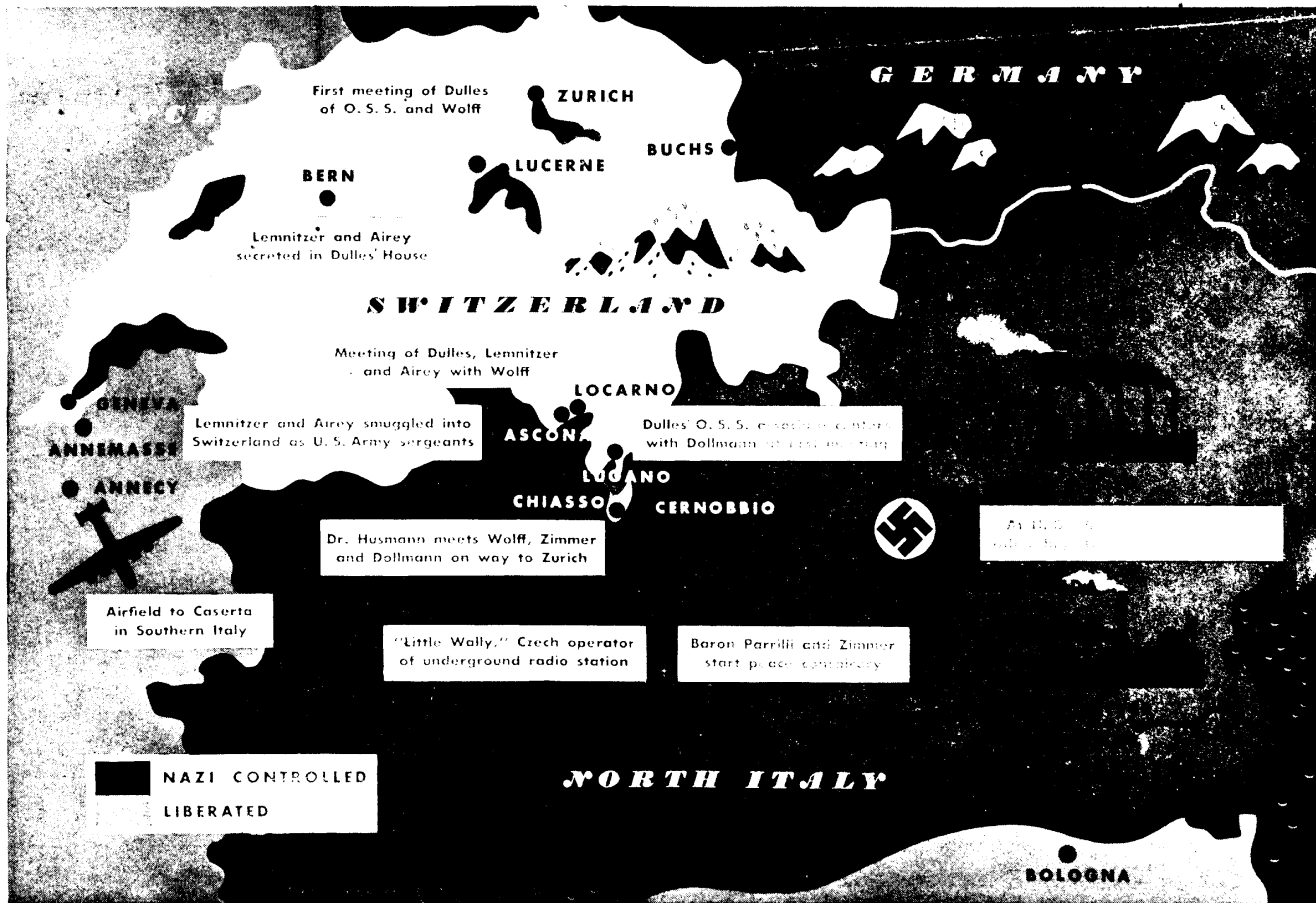
The scene of the action. The battle-weary Nazis wanted to surrender an army and shorten the war and save thousands of lives. But they mistrusted one another, mistrusted the area's top commander and, above all, they mistrusted Adolf Hitler.