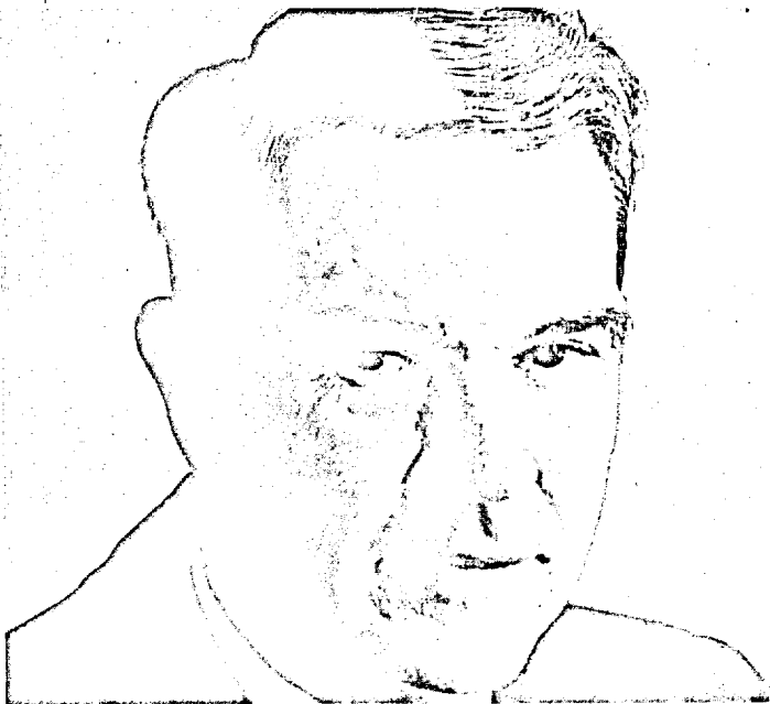
Mahon: "Congress, often has substantially and importantly changed the course of defense programs giving them new direction and emphasis."

constantly improve its state of readiness, the Committee took a long look at the request. Ultimately, the Armed Services Committee authorized not only the destroyers but added funding for a nuclear frigate and the long leadtime money for a second nuclear frigate. The Appropriations Committee, on the other hand, recommended and budgeted only the necessary funding for the frigates and not that for the destroyers. In this manner Congress asserted its influence on the future of the surface navy.