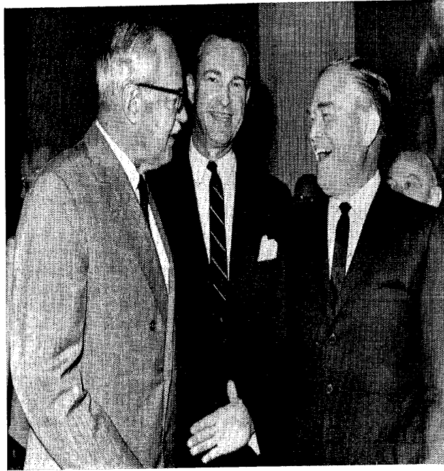
DULLES, HELMS & RABORN

The agency’s workaday labors, the tedious accumulation and evaluation of infinite quantities of minutiae, have more in common with IBM’s 360 than with Ian Fleming’s 007. The task demands high intelligence as well as patience. A State Department veteran once said: “You’ll find more liberal intellectuals per square inch at CIA than anywhere else in the Government.” Indeed, the agency is staffed from top to bottom with some of the nation’s best-qualified experts; 30% have Ph.Ds. They are linguists, economists, cartographers, psychiatrists, agriculturalists, and