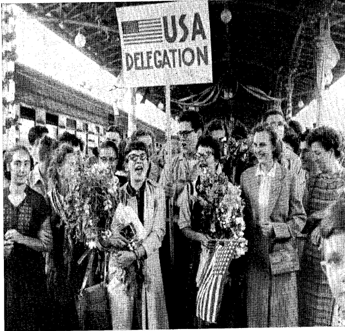
STUDENTS ARRIVING FOR WORLD YOUTH FESTIVAL IN MOSCOW (1957)

the emotionalism of young Americans who worship honesty. It aroused the outrage of many in the academic community who—mistakenly—regard CIA as an evil manipulator of foreign policy. And the furor showed again how readily Americans, who, while seldom acknowledging the quiet and generally successful performance of their intelligence com-