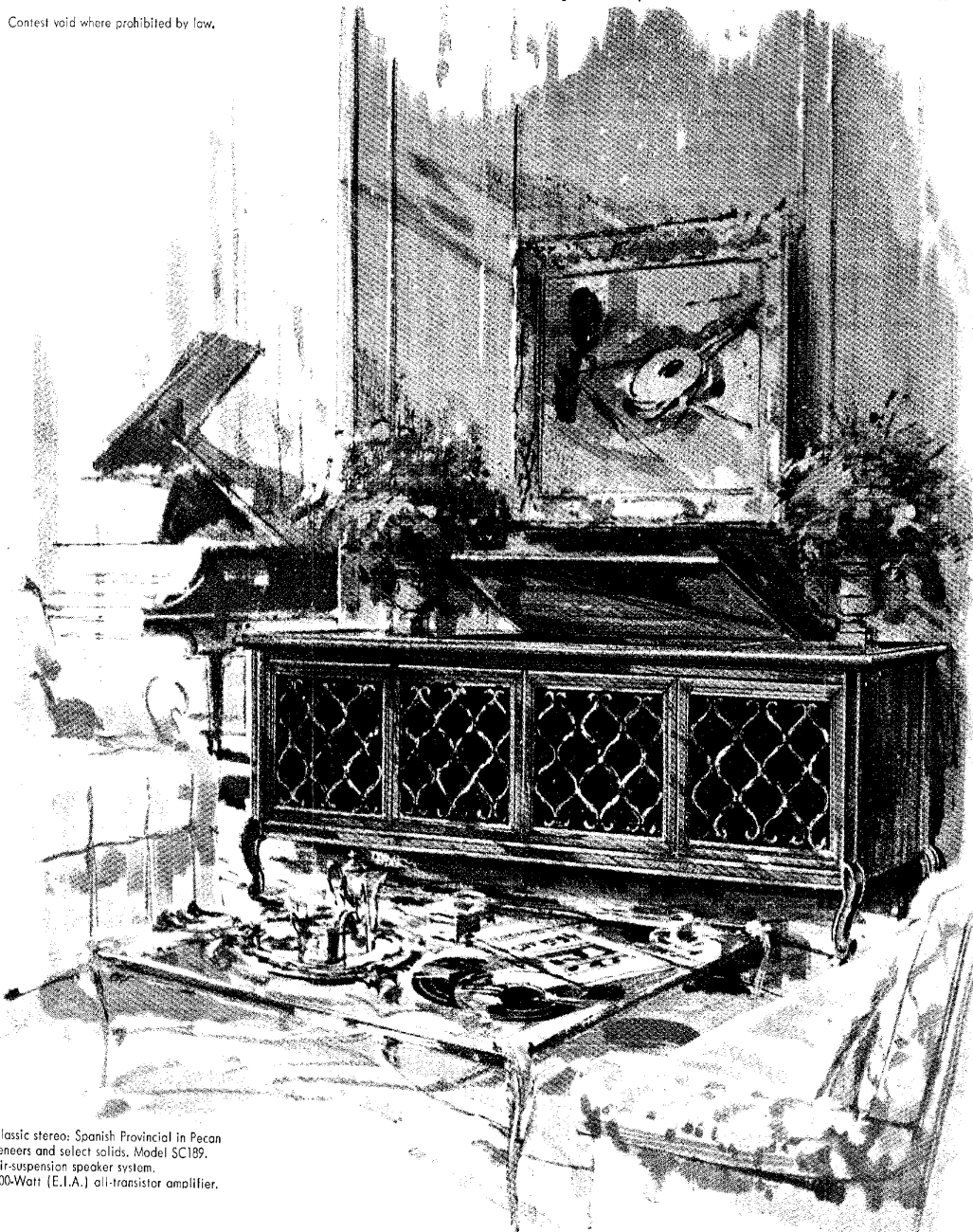
Classic stereo: Spanish Provincial in Pecan veneers and select solids. Model SC189. Air-suspension speaker system. 100-Watt (E.I.A.) all-transistor amplifier.

If you win, you'll never want to hear the end of it!