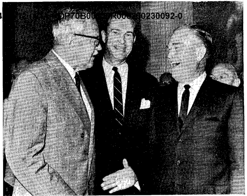
DULLES, HELMS & RABORN

The agency's workaday labors, the tedious accumulation and evaluation of infinite quantities of minutiae, have more in common with IBM's 360 than with Ian Fleming's 007. The task demands high intelligence as well as patience. A State Department veteran once said: "You'll find more liberal intellectuals per square inch at CIA than anywhere else in the Government." Indeed, the agency is staffed from top to bottom with some of the nation's best-qualified experts; 30% have Ph.Ds. They are linguists, geographers, chem-