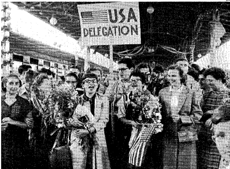
STUDENTS ARRIVING FOR WORLD YOUTH FESTIVAL IN MOSCOW (1957)

the emotionalism of young Americans who worship honesty. It aroused the outrage of many in the academic community who—mistakenly—regard CIA as an evil manipulator of foreign policy. And the furor showed again how readily Americans, who, while seldom acknowledging the quiet and generally successful performance of their intelligence com-