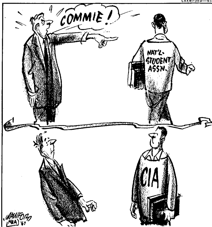
CARTOONIST'S VIEW OF HOW THINGS DO CHANGE Nothing in the desk drawer but cash.

The Firm. Even in 1965, there were growing rumors among many students that most of N.S.A.'s money was coming from the Federal Government. CIA had not yet been publicly fingered as the association's moneybags, but the State Department was a subject of dark suspicion. That year, N.S.A. President-to-be