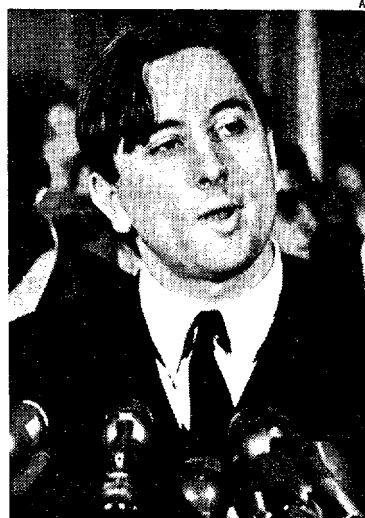
A firm admission.

Up to Pittsburgh? President Johnson resorted to the hoary political expedient of naming a committee. CIA Director Helms, Under Secretary of State Nicholas Katzenbach, and Health, Education and Welfare Secretary John Gardner were appointed to review the operations of the CIA and other Government agencies to see if they "endanger the integrity and independence of the educational community." The President's action was not calculated to defend the agency. Grieved one of the agency's old-timers: "The CIA has become a dirty household word; it's become fashionable to knock it. Maybe we ought to just give headquarters to the Defense Department for an annex and go up to Pittsburgh, rent an apartment and start all over again."