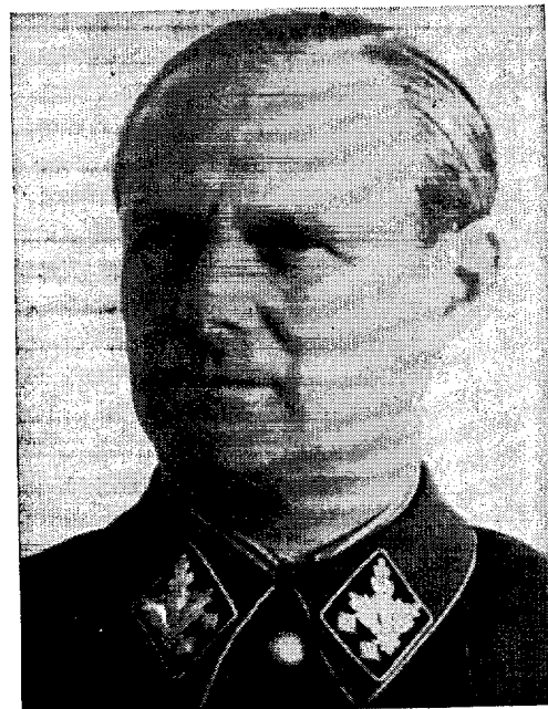
General Karl Wolff

security and isolation, and it was close to the Italian frontier.* The placid lake, among towering mountains, created an atmosphere of serenity and calm. It was hard to believe that not many miles north of us a war was being waged in those mountains. All our surroundings breathed peace and mirrored beauty. It was no accident that Locarno, only a few miles away, had once been selected for a famous peace conference. For a secret meeting between Allied and German officers, here was the perfect spot.