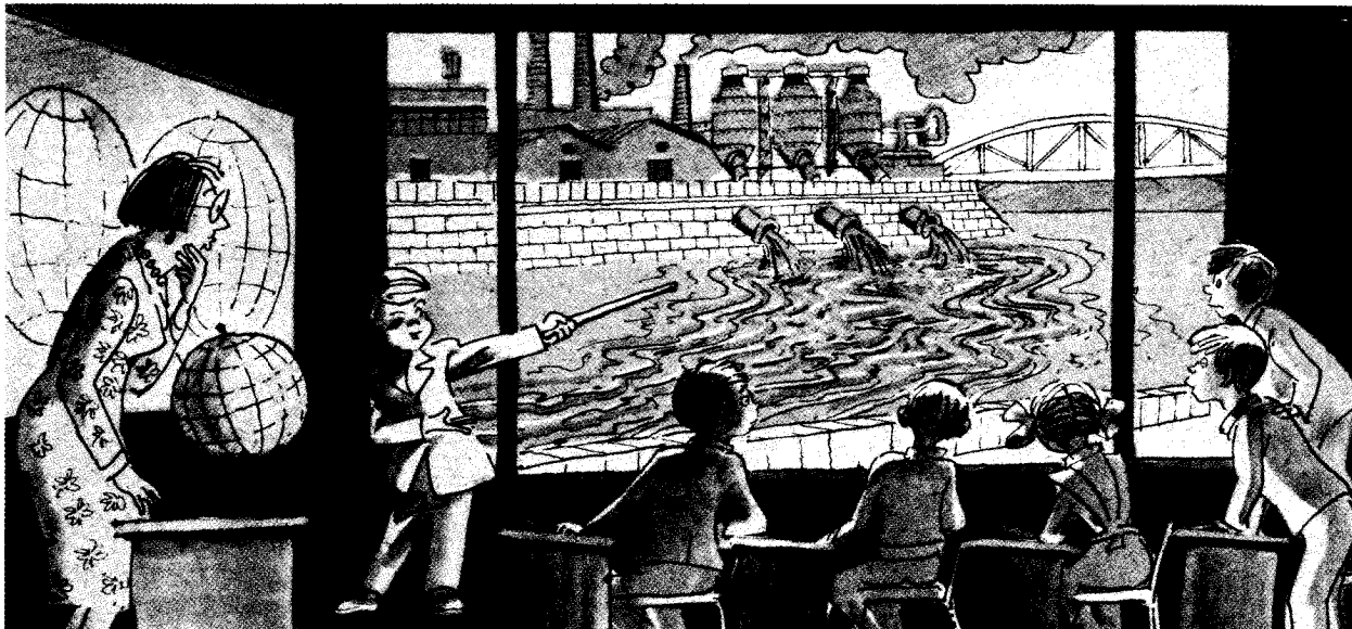
And the source of our city's river is this factory.