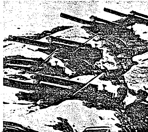
Under eye in sky: Soviet guns near Kabul.

So far, even spies in the sky have not come up with that answer. □