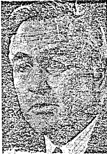
Admiral Stansfield Turner: Outspoken CIA director.

Like his proposal to register potential military conscripts, the President believes that a relaxation of some of the constraints on the CIA will improve