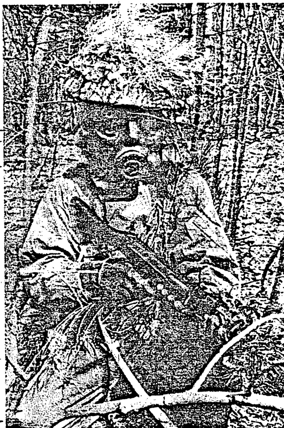
NATO soldier clothed to resist chemicals

Convulsions and a danger of drowning in body juices.