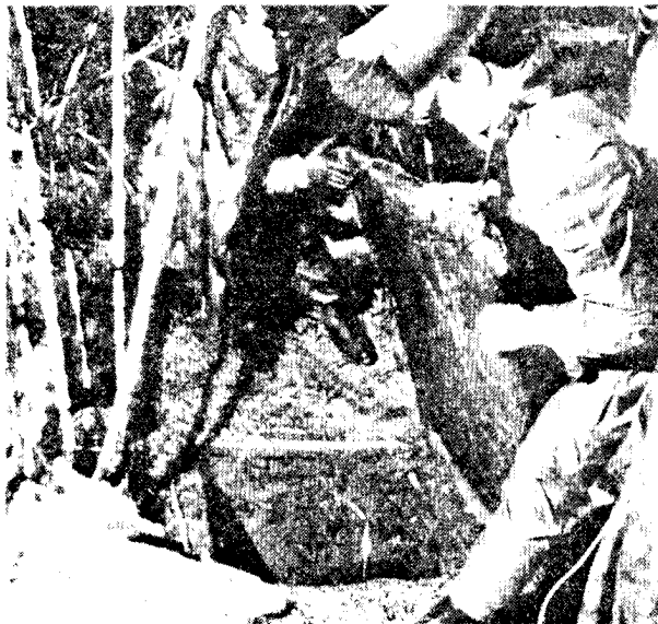
Figure 4. Chilean soldier opens door to 4-foot shaft leading to underground compartment used to hide guerrillas and store food, arms, and medical supplies. [REDACTED]