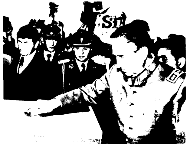
Figure 1. Gen. Augusto Pinochet casts his vote in the national constitutional plebiscite, September 1980. [REDACTED]

The transitory articles that will govern the period until 1990, however, are not conducive to a successful return to democracy. Rather than a phased return to elective rule, the articles allow Pinochet to continue to ban political activity until 1989. The junta will then nominate a president who is to be approved in a plebiscite for an eight-year term. Only then will congressional elections be called. Pinochet, who is now 65, probably assumes that with the power of incumbency and his ability to keep a strong opponent from